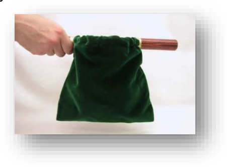
Page 12 of 17

Jesus also said: "There is more happiness in giving than in receiving" (Acts 20:35). Have you ever heard anybody say: "You ought to give 'til it hurts!" No way! You ought to give until it feels good. Giving makes me happy.